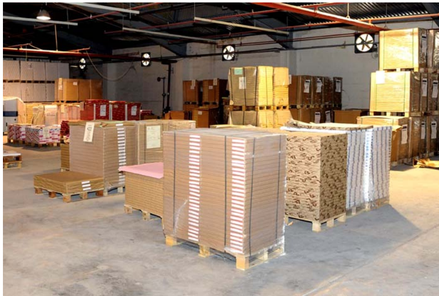
❖ Photo 12: Stocks of paper are stored in an interconnecting giant warehouse.