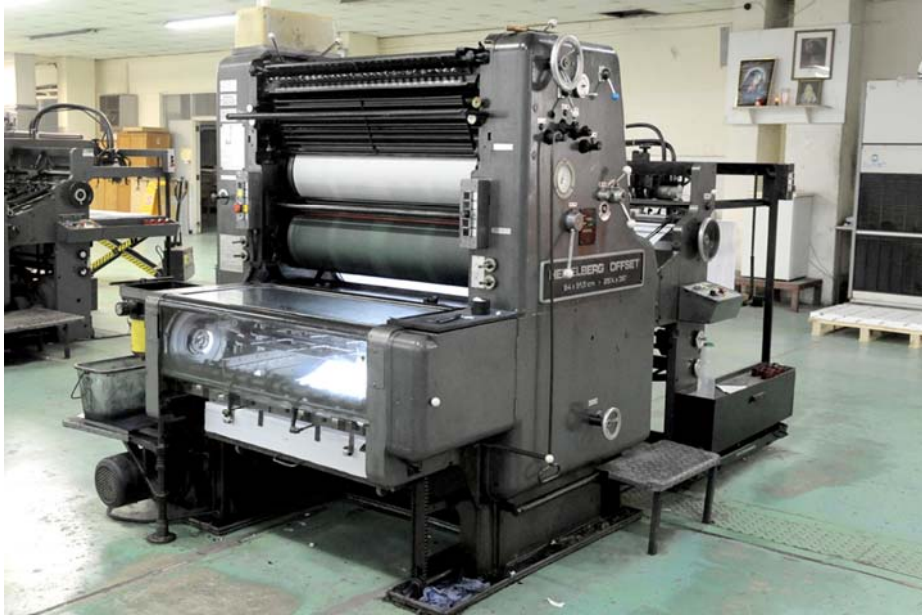
❖ Photo 5: One of the 3 one colour SORD machines in service at the Press.