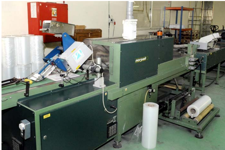
❖ Photo 10: Mailing machine: Used mainly for the addressing and mailing of the Government Gazette.