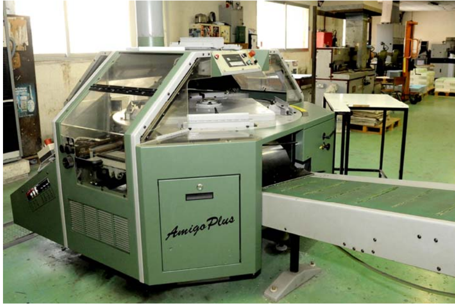
❖ Photo 9: The Perfect Binding machine- Books are glued together at the spine with strong flexible glue. The end result is similar to paperback books.